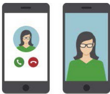
Live Telephonic Sessions