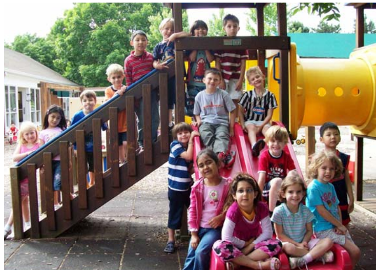
The Ohio State University Child Care Program Class of 2009

Older Children: Helping take care of pets gives older children feelings of responsibility. Pets can boost self-esteem by giving children an experience of unconditional love. No matter what's going on at school, or with their friends, pets treat children the same way. Finally, older children can learn about the life cycle from pets.